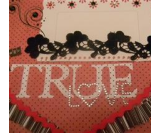
You are my True Love