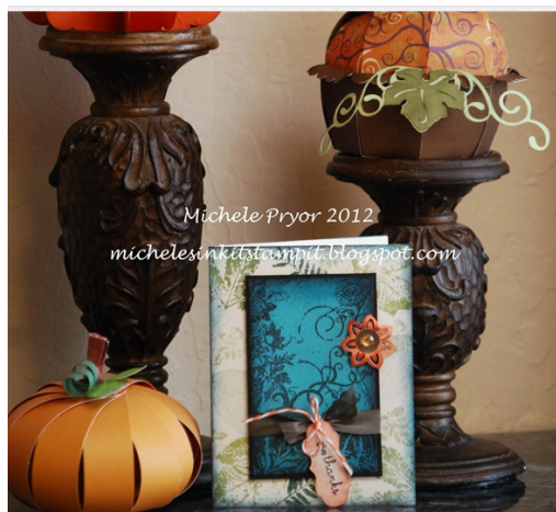
Michele Pryor 2012 michelesinkitstampit.blogspot.com