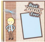
Best Father Ever layout