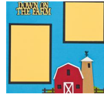
Down on the Farm Layout