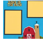
Down on the Farm Layout