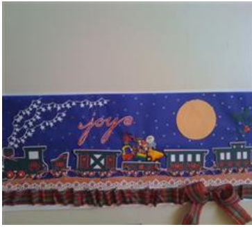
Folk Art Challenge

You will need your Tool Kit to weed out all the little pieces in the train and border. For the little tiny toys, you will need your tweezers, patience and toothpicks for the glue.