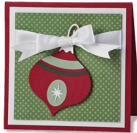
Christmas Ornamant Card