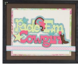
Ride 'Em Cowgirl Frame