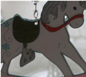
Glossy accents on the reins and saddle add lots of contrast

Glue reins,saddles,and stirrups on to each side of horse.