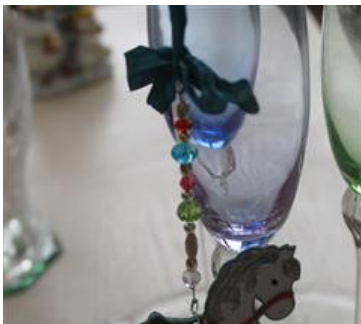
The ribbon and crystal hanger are the perfect accents for this ornament

Tie double bow in seam binding leaving long tails. Tie tails in long loop above bow. Thread beads on silver twine. Attach jump rings on each end of beaded twine.