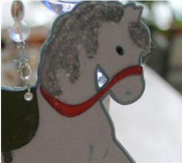
Showing embossing and chunky glitter

Use Cuddlebug and the Koi fish folder from the Plum Blossom Set to emboss tails manes and forelocks. Position pieces on folder's swirls so it gives the impression of flowing hair. Run all pieces through the Xyron and sprinkle with Martha Stewart's chunky clear glitter. Glue manes, tails and forelocks on horse and horse (flip-h). Use fine point black pen to color in horse's eyes.