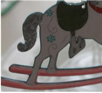
Flocking looks like snow on rockers

Fussy-cut rockers off Horse(blackout) and Horse(blackout)(Flip-h) Glue pink rockers onto to each side of dark grey horse shadow under hooves.Glue hooves down on pink rockers. Run 1/8 Sookwang tape along top of all 4 rockers and cover with white flocking . Pat flocking into adhesive to give the effect of snow.