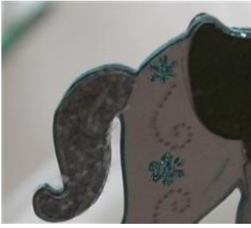
Close-up of de-bossing filled with glitter