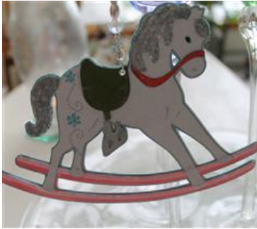
Completed Project shows colors for layers

Horse-s @4.5 (flip-h) dark green - use Hide Conture to hide reins,tail,mane and forelock *93 106 24