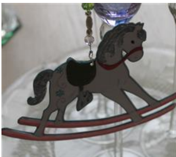
All edges and details inked

Assemble the horse shadow and horse shadow (flip-h) dark grey back to back