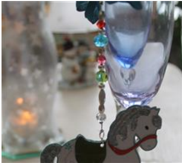
Showing where hole is punched on ornament to allow it to hang straight

Punch small hole on top of saddle on horse, attach jump ring. Join jump ring on saddle to jump ring on beaded twine. Attach jump ring on the top of beaded twine to center of bow.