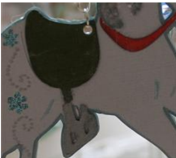
Line up saddle and stirrup

Add metallic sheen to stirrups with Smooch silver