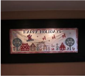
Happy Holidays Mirror 2