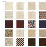
Cricut Imagine® Colors & Patterns, Vintage Papers