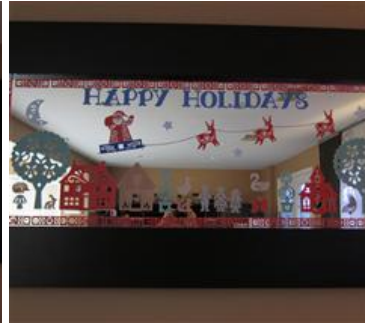
Happy Holidays, no drop