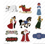
A Quilted Christmas Cartridge