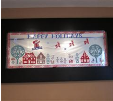
Happy Holidays Mirror