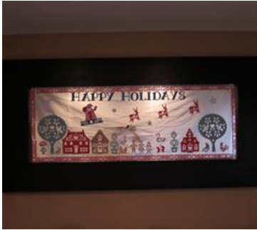
Happy Holidays Mirror 2