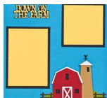
Down on the Farm Layout