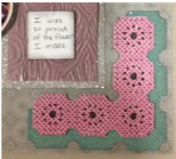
border close up

I used the gypsy to weld one of the borders from the Folk Art Festival Cartridge into a square shape. Then I cut out the main image as well as the blackout (in the square shape). I divided this square into quarters to make my corner pieces. I cut out a larger version of the blackout square (teal) to put behind the first image (pink). I distressed the edges of this as well.