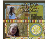
The Great Outdoors Layout