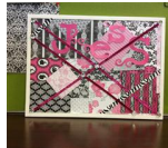
Easy DIY Bulletin Board.