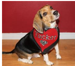
Valentine Doggie Bandana