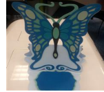
Butterfly Display card