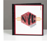
NYC 2009 Mini Album