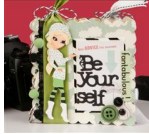
Be Yourself Mini Album