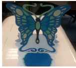
Butterfly Display card