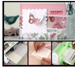
Butterfly Kisses Card