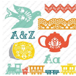
Cricut® Folk Art Festival Cartridge