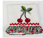
Cherry Dish towel