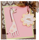
Happy Birthday Card - Giraffe