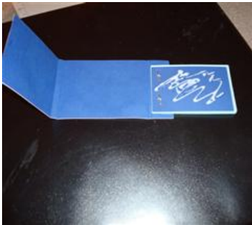
Assemble and glue the card stock

Glue the cardstock to the inside of the 'matchbook'.