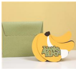
Thanks A Bunch Card