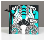
Thanks Designer Card