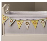
Welcome Crib Banner