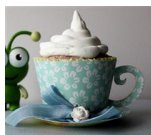
Tea Cup Cupcake Holder