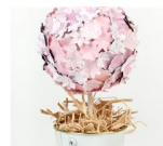
Mother's Day Centerpiece