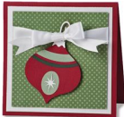
Christmas Ornament Card