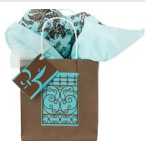
Gate Gift Bag