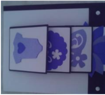
Front of the card as given.

Okay, now make it look like the picture. :) This cut coordinates with the instructions found on Jane's blog http://whoopsiedaisy-jane.blogspot.com/2007/07/waterfall-cards-instructions.html .