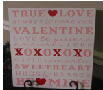
Word Collage Boards