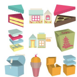
Sweet Tooth Boxes Cartridge