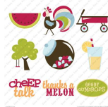
Cricut® "Just Because" Cards Cartridge