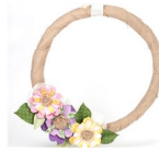
Mother's Day Wreath