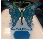
Butterfly Display card