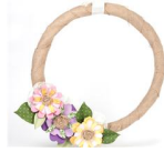
Mother's Day Wreath