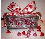
Hugs & Kisses Glass Block