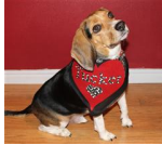
Valentine Doggie Bandana