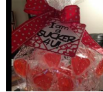
Valentines Sucker Gift Basket