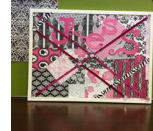
Easy DIY Bulletin Board.