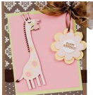
Happy Birthday Card - Giraffe