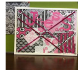
Easy DIY Bulletin Board.