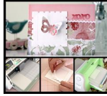
Butterfly Kisses Card