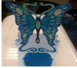
Butterfly Display card