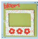
Flower Frame Layout