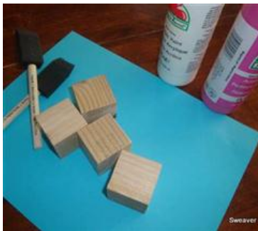
2x2 inch blocks, ready to paint!

Paint 2 blocks Pink and 2 blocks white. Don't paint too thick, it will make sanding a little more difficult. however, for good color, you will want to make sure to paint it thick enough.