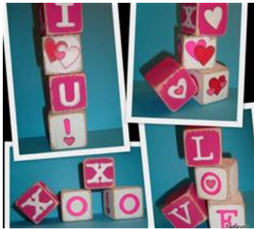
Endless ways to show it!

Mix and match and have fun displaying your project!