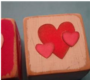
Inking the edges of the die cuts, adds depth and personality

Use an ink pad along the edges of the paper to add depth and special effect! I used Dew Drop fast drying pigment ink Brilliance in crimson copper.