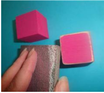
Sanded edges make it more rustic

Sand all of the edges of the blocks. A sanding block works well, though any semi-harsh sandpaper will do. Try different directions to add effect.