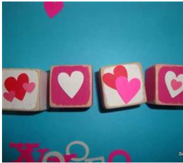
practice the layout of the die cuts before gluing

Layout the cutouts and plan ahead.. there's nothing worse than changing your mind after gluing - or even worse, making a mistake and gluing down the cutout in the wrong place!