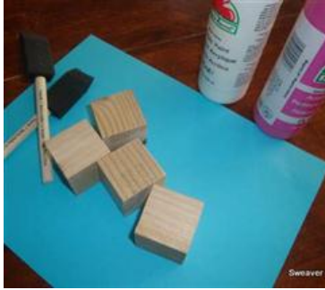
2x2 inch blocks, ready to paint!

If you can't find 2x2 inch blocks, cut a 4x4 inch post (found at hardware store) into 8 2x2 inch blocks.