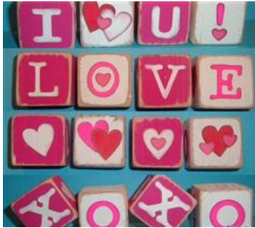
4 ways to say I love you!

Glue down each cutout. *Pick a side to be the top and the bottom. Glue the first phrase across the fronts of all blocks, then turn left and choose the 2nd phrase and so on.. Doing it this way makes it so you only need turn the blocks to see the next image - and prevents it from getting scratched from stacking or moving them.* A tip I used to keep the paper from curling and lifting, was to hold it down for a few seconds and then face it down and let the block apply the even pressure for about a minute.