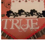
You are my True Love