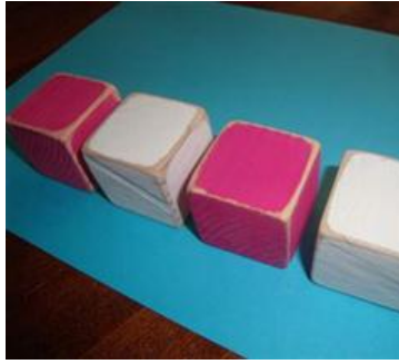
All sanded up!