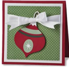
Christmas Ornamant Card