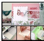
Butterfly Kisses Card