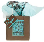
Gate Gift Bag