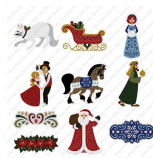
A Quilted Christmas Cartridge