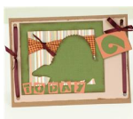
'6 Today' Card