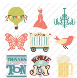
Everyday Pop-Up Cards Cartridge