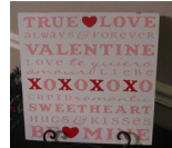
Word Collage Boards