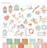
Cricut Imagine® Art Cartridge, Lori's Garden