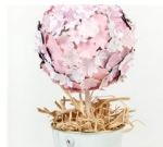
Mother's Day Centerpiece