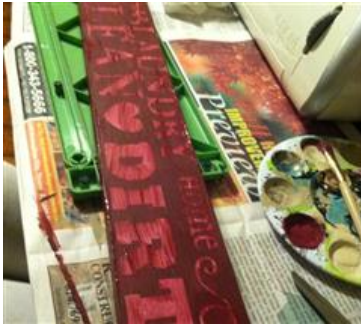
Painted red over the letters