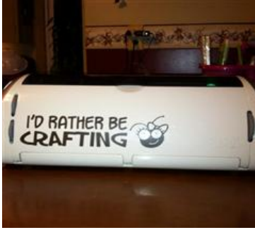
Rather be crafting