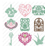
Damask Décor Cartridge