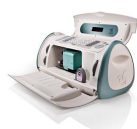
Cricut Create™ Machine