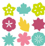
Cricut® Mother's Day Bouquet Seasonal Cartridge