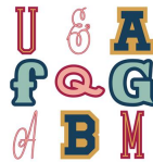
Extreme Fonts Cartridge