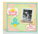
Spring Break Layout