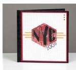
NYC 2009 Mini Album