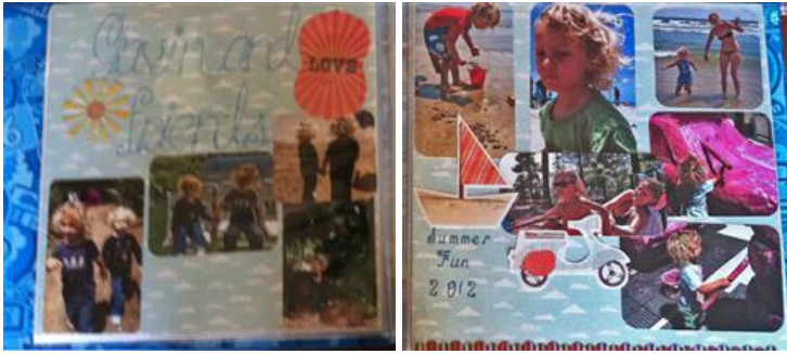
SCRAPBOOK PAGE WITH EXTREME FONT CARTRIDGE

replace the cutting blade in the Cricut Machine with a pen and holder made for the machine.