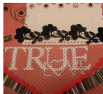
You are my True Love