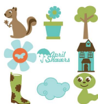
April Showers Cartridge